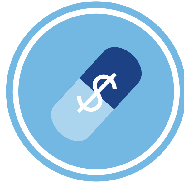
Other High-Cost Drugs