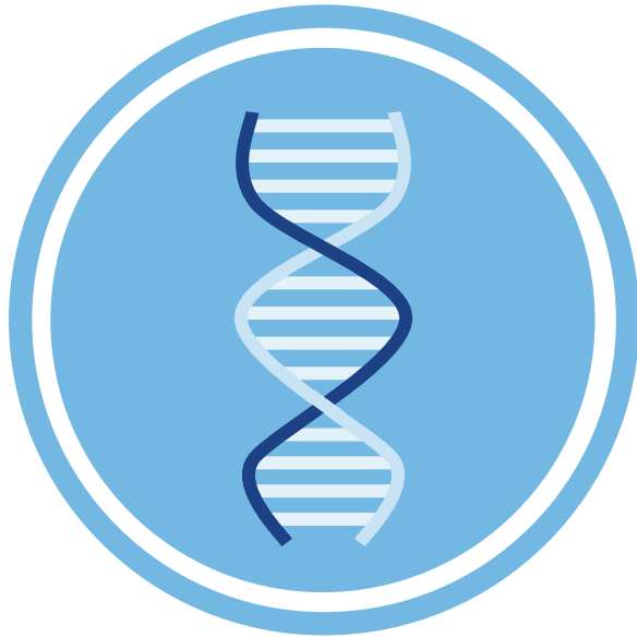
Cell and Gene Therapies